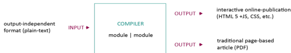
Fig. 3 The basic design for the technical infrastructure